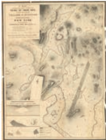
Map of vein of iron ore adjoining the village of McIntyre Essex County New York belonging to the Adirondack Iron and Steel Co., by Ebenezer Emmons, 1840. 15 in. x 22 in. Adirondack Experience Library. General map collection #0390. In the public domain.

The Adirondack Experience (ADKX), recently received a $60,500 grant from the Digitizing Hidden Collections program of the Council on Library and Information Resources (CLIR), an independent, nonprofit organization that forges strategies to enhance research, teaching, and learning environments in collaboration with libraries, cultural institutions, and communities of higher learning. Past funding from CLIR has supported the cataloging and digitization of more than 15,000 images from the museum's photograph collections.