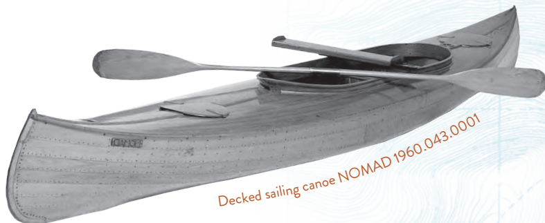
Decked sailing canoe NOMAD 1960.043.0001