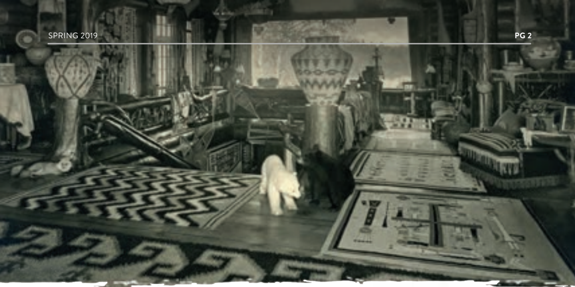
(Above) Camp Topridge P068588