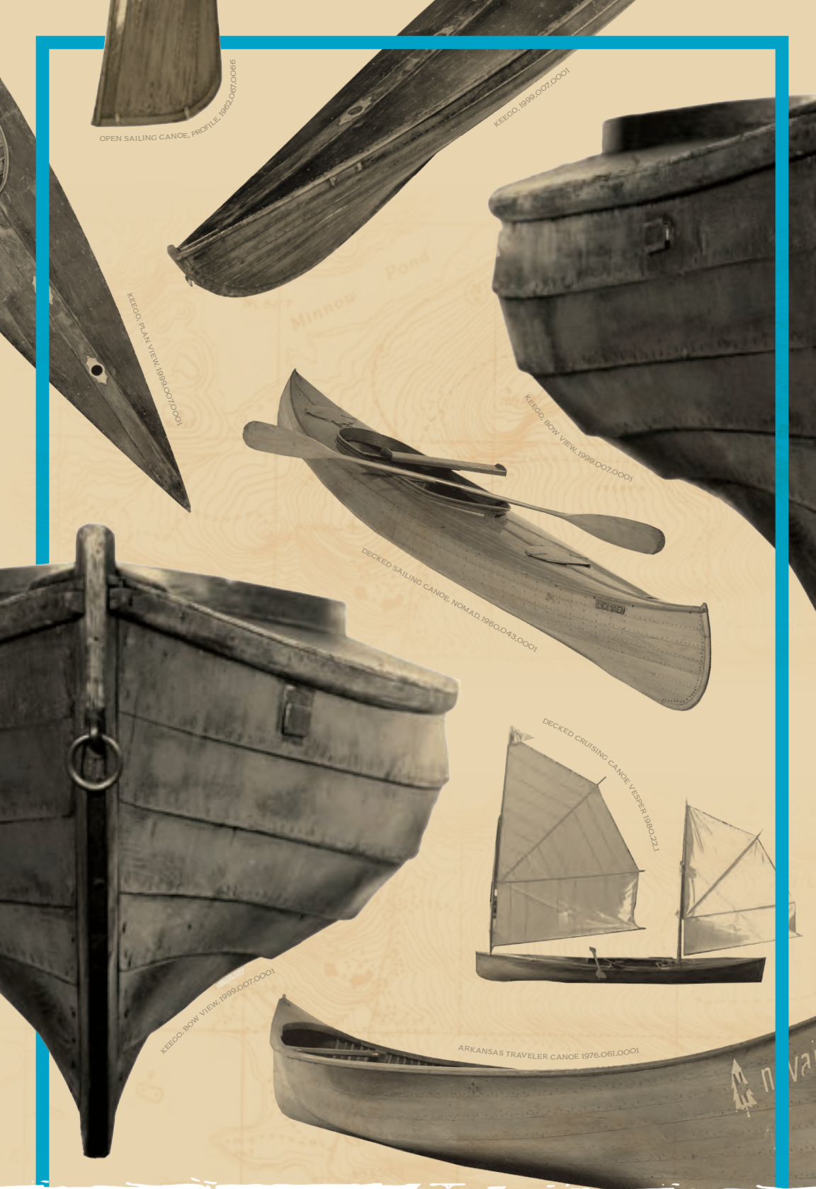
OPEN SAILING CANOE, PROFILE, 1993.067.0066