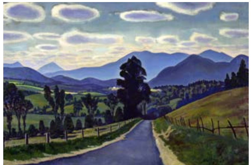
Sample of pieces from our collection to be featured in Artists & Inspiration in the Wild.