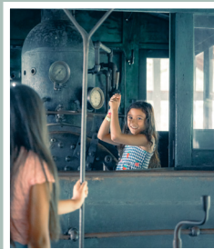
Climb aboard the Porter Engine