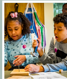
Create your own art in the ADKX Art Lab