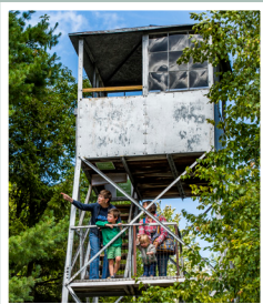
Climb the Whiteface Mountain Firetower