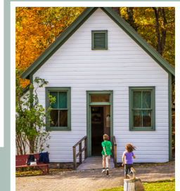
Visit our one-room schoolhouse