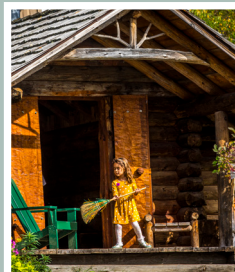
Imagine rustic life in a kid-sized cabin