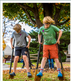
Campus games on the green